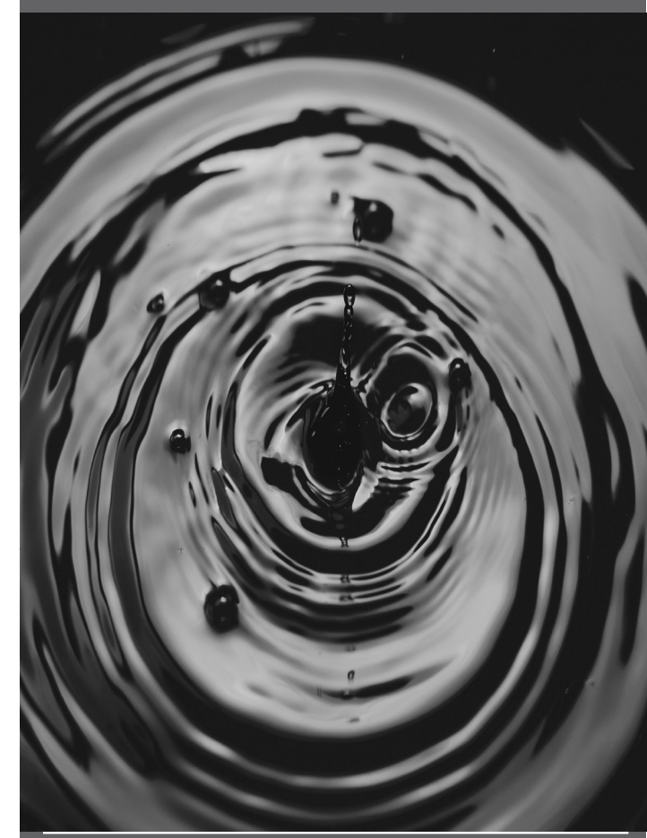
This annual "consumer confidence report" also includes information on topics such as where our water comes from, what is being done to improve the water system, and how you can help preserve our water supply. Para acceder a este informe en español, visite https://www.meridenct.gov